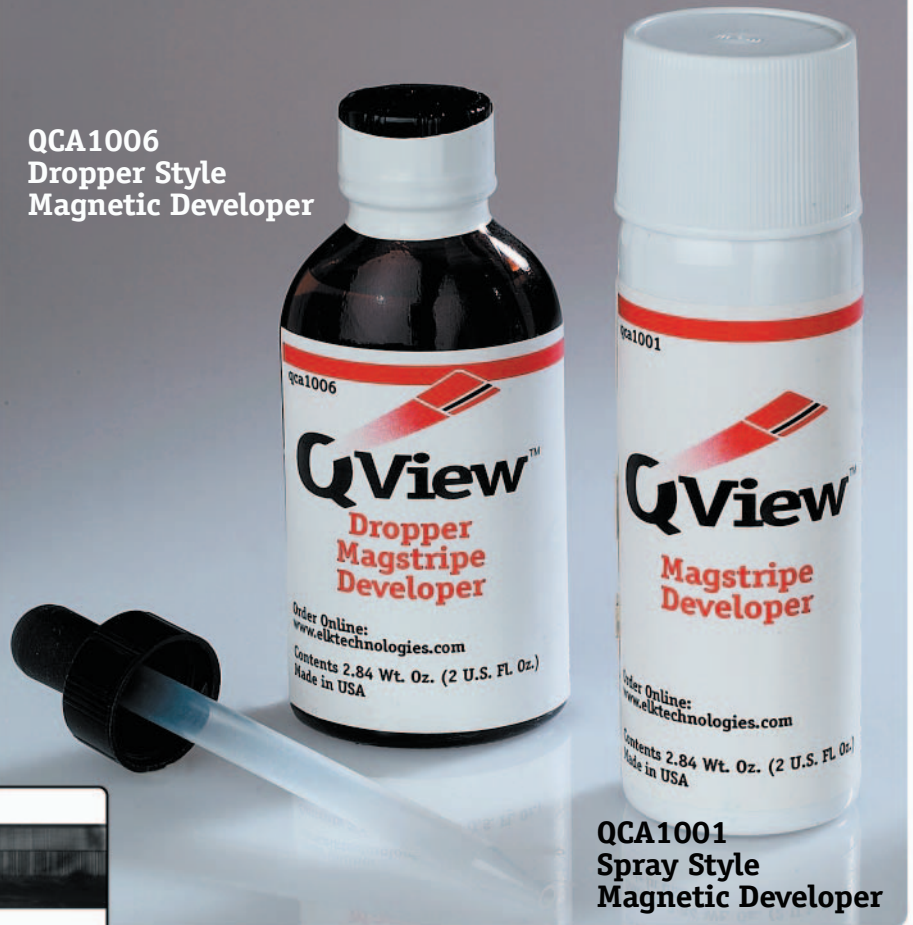
QCA1001 Spray Style Magnetic Developer

For help with ordering developer and obtaining additional information about our products, call Q-Card at 800-717-8007 or 570-286-7447.